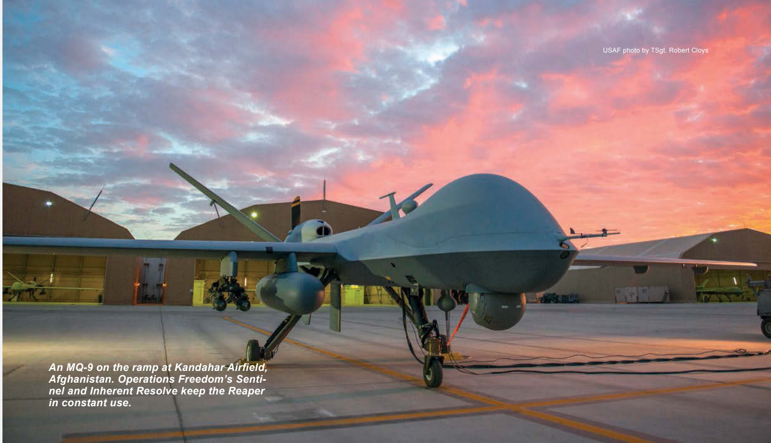
An MQ-9 on the ramp at Kandahar Airfield, Afghanistan. Operations Freedom's Sentinel and Inherent Resolve keep the Reaper in constant use.