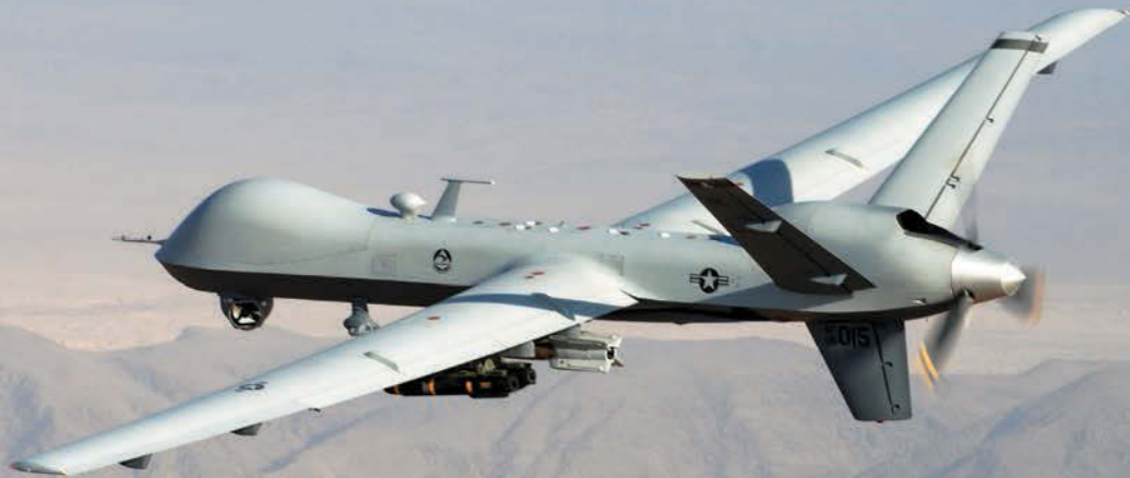
A Reaper loaded with GBU-12 Paveway II and AGM-114 Hellfire missiles on a mission over Afghanistan. The RPA force has been stretched thin due to an unrelenting and steadily increasing operating tempo.