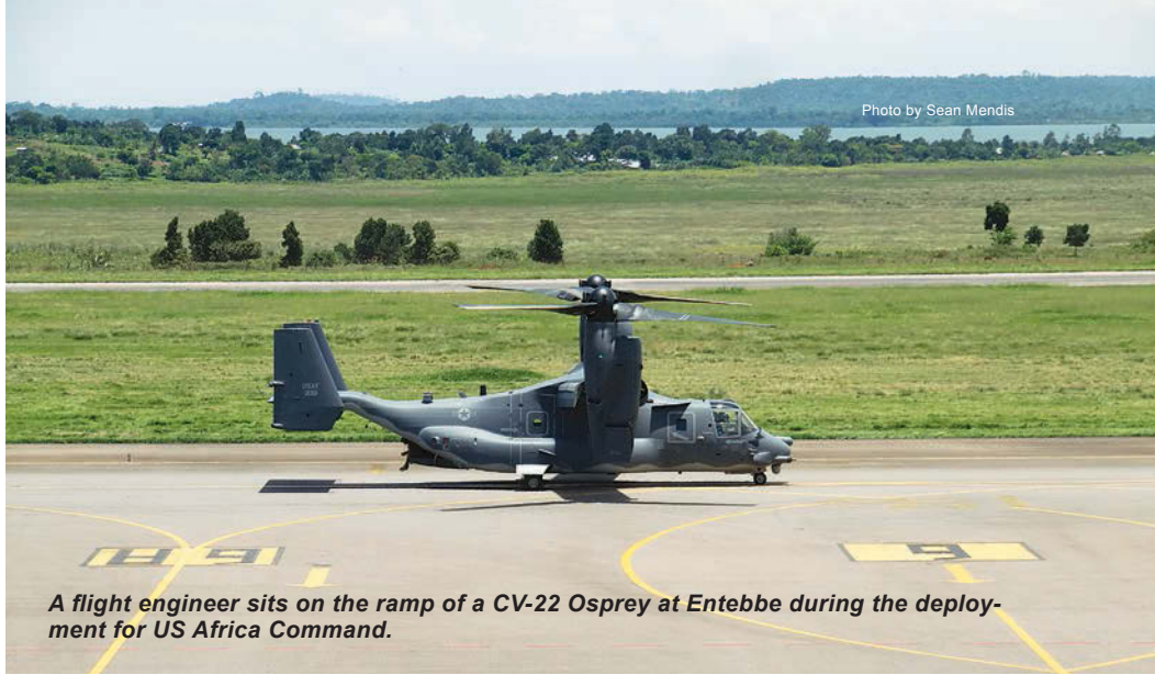
A flight engineer sits on the ramp of a CV-22 Osprey at Entebbe during the deployment for US Africa Command.