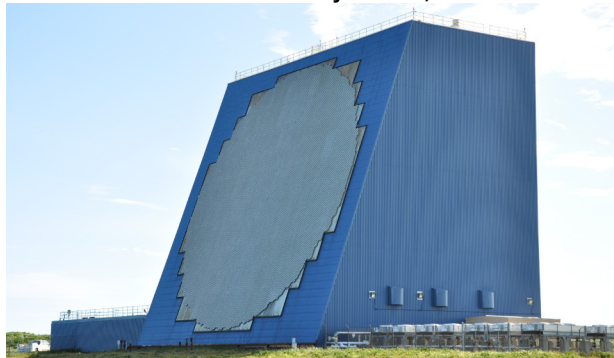
The Cobra Dane Radar on Shemya Island, Alaska

In its January 2018 report to Congress, the Air Force reported how the Cobra Dane radar and the Long Range Discrimination Radar (LRDR) have shared and unique capabilities to support ballistic missile defense and space surveillance missions. The report noted that the respective locations of both radar systems affect their ability to provide those capabilities. The Department of Defense (DOD) also has other radar investments—the Pacific Radar and the Space Fence, which, according to DOD officials, may reduce DOD's reliance on Cobra Dane to provide ballistic missile defense and space surveillance capabilities.