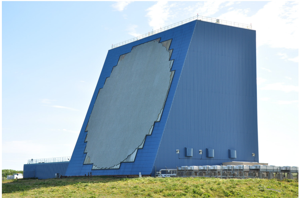
Figure 1: The Cobra Dane Radar